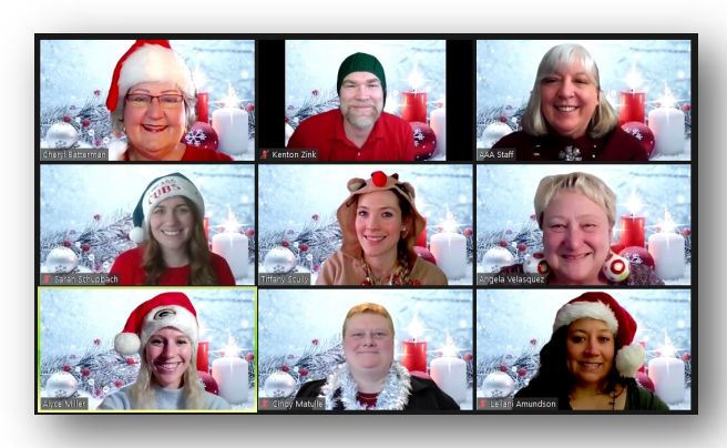
2020 AAA Holiday Zoom Staff Meeting

*49 Spanish-Speaking CM Clients & 537 Service Hours & 11 SE Asian CM Clients & 269 Service Hours **30 African American & 42 Latinx Senior Adults ***Elder Benefit Specialist (EBS) Program